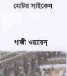
গালী ওয়্যার ভানার তার (এসইসি, এলি, এইচ ভিনিসি)