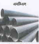
এনটিএল এসিআই, বিআই, এসএস পাইপ