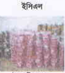
ইসিএল বৈদ্যুতিক তার