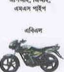
এবিএল মোটর সাইকেল