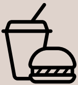
Food & Beverages

Halal Trade, Logistics and Manufacturing Expo will further strengthen Africa's position as a global halal hub and put forward the economic values of Halal for the world.