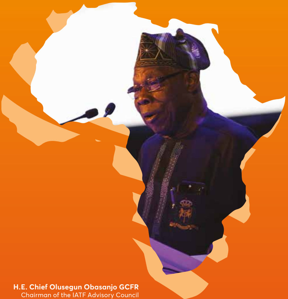
H.E. Chief Olusegun Obasanjo GCFR Chairman of the IATF Advisory Council and Former President of Nigeria

IATF2025 will provide a unique and valuable platform for businesses to access a single African market of over 1.4 billion people with a GDP of over US$3.5 trillion created under the African Continental Free Trade Area.